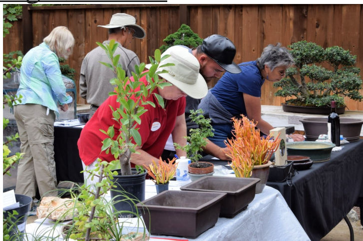
Which pots did you bid on at the May meeting silent auction at the Bonsai Pavilion in the Safari Park?