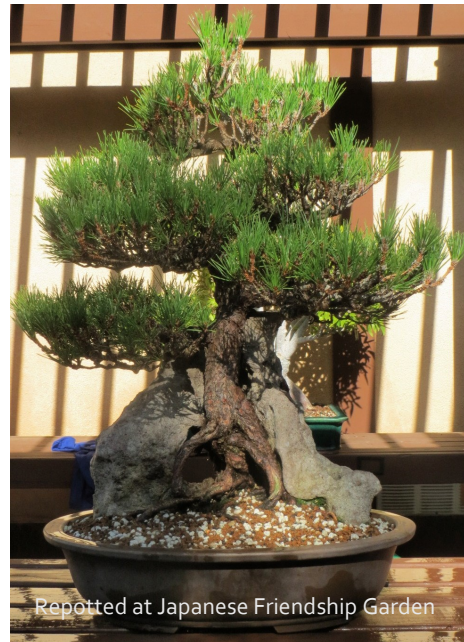
Repotting at Japanese Friendship Garden

Bonsai combines the beauty of manmade sculpture with the harmony and perfection of nature