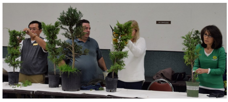
Learning to Wire in the Beginning Class