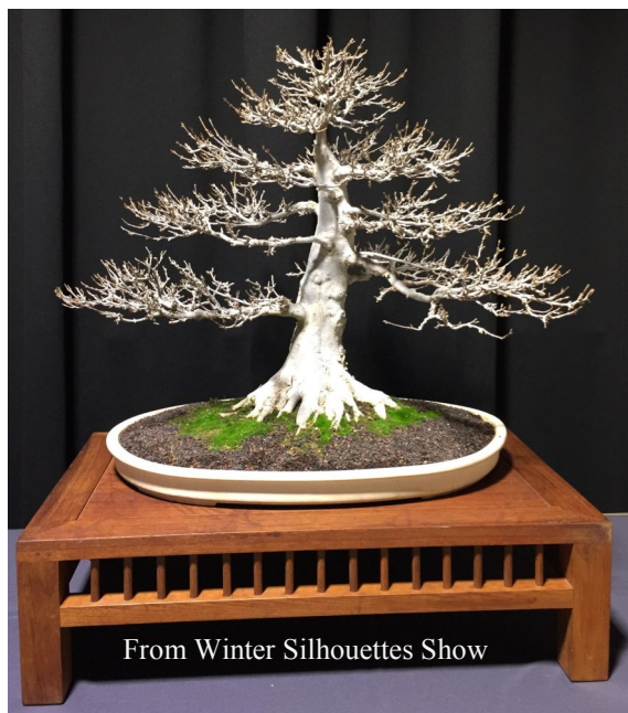
From Winter Silhouettes Show

The Bonsai Wire (TBW) is published monthly by the San Diego Bonsai Club (SDBC) except for May. TBW and the SDBC logo are properties of SDBC. Articles are provided by SDBC members. Any articles submitted by non-SDBC members—if published—become property of SDBC. All submitted articles are subject to editing. No part of this publication may be reproduced without written permission from the SDBC Board.