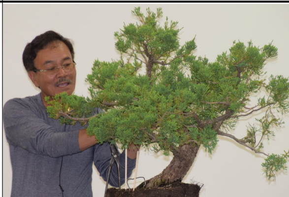
Above is the start of the first styling