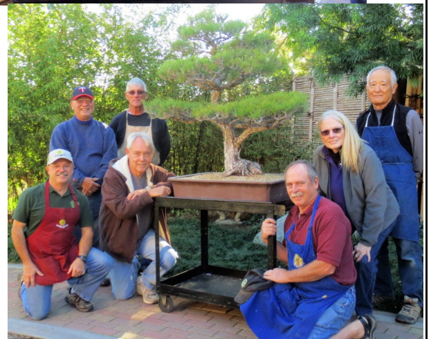
The large pine at the JFG in its pot in new, fresh soil