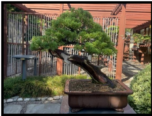
photo--the one with movement to the left. The beautiful red inner bark is now revealed after removal of more of the older bark from the rest of the trunk. Some minor work was done on the shari and jins. Then lime sulfur was applied to all of the dead wood.