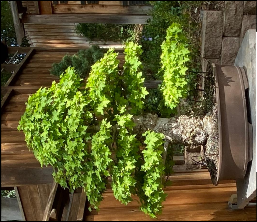
December 2024 The Bonsai Wire