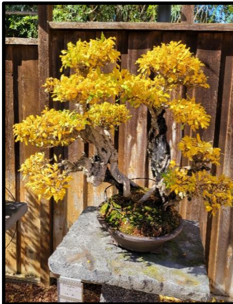
Below: Pomegranates are in full color.