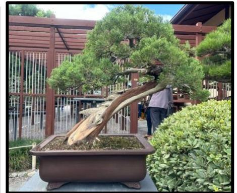
Glenn's tree after completion of deadwood work.