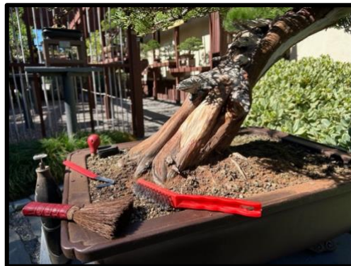
Carving tools and deadwood work-in-progress on Glenn's tree.