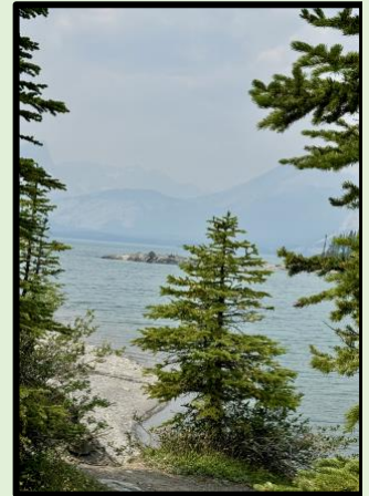
Potential Bonsai seen at Peter Lougheed Provincial Park Alberta Canada