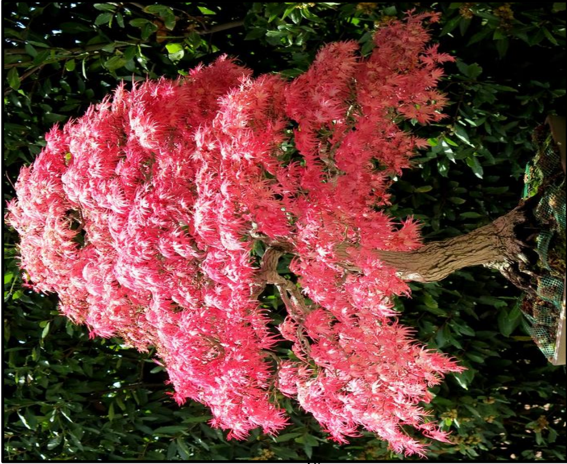
November 2023 The Bonsai Wire