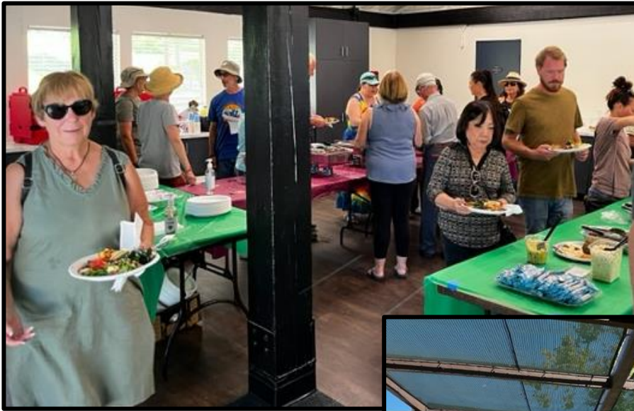
Food and Fun at Lake Poway Picnic