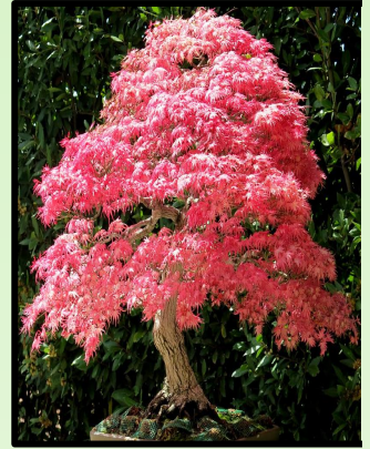
Fall foliage from internet gallery.