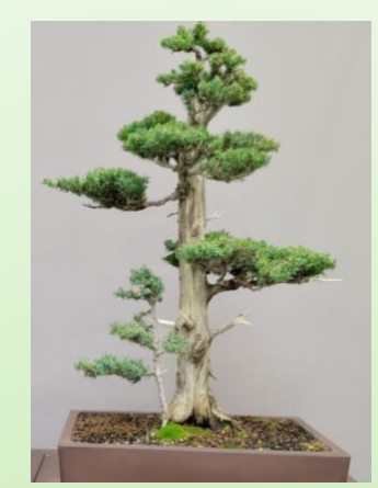
San Diego Bonsai Club Spring Show

Finally, keep an eye on your trees as we transition into summer. Pest management and watering schedules will need attention.