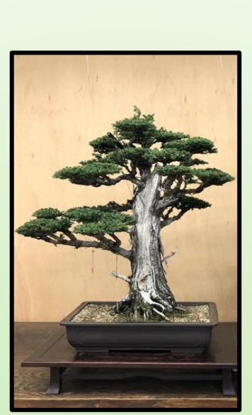
Tree designed by Julian Tsai

"Speaking of instruction, we have a new Beginner class starting next month as well as a workshop. When our teachers provide instruction during classes, workshops, and clinics on topics such as repotting, pruning, and soil composition, they teach in such a way that we establish an education baseline. We want members to have a baseline so we know that they have at the very least, knowledge that can be applied to the trees in their collection to maintain them in a healthy way. There is typically more than one way to perform the various tasks associated with bonsai. We appreciate that members may choose to perform activities in different ways. We will always teach in a way that we know works for our club members and takes into account the diverse species found in our region.