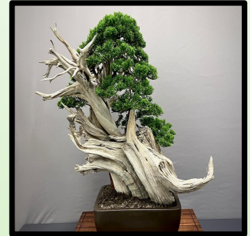
Fall show bonsai