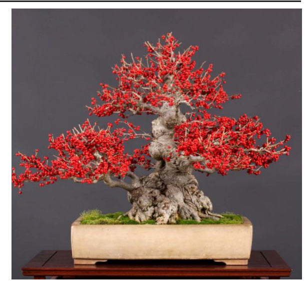
Jeff Stern - Ilex Serrata

GSBF Bonsai Rendezvous will include a sales area that is open to the public, offering plants, tools, pots, etc.