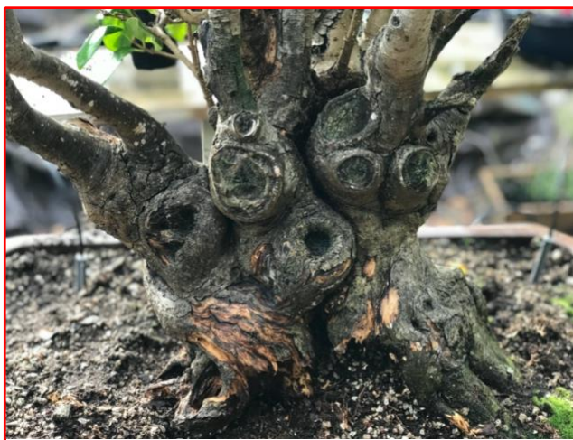
Privet, dead side of trunk, December 2019

The newest tree to "graduate" from the lower garden to the display area is a wax-leaf privet ( ligustrum japonicum "texanum") donated by Linda and Paul Vicina in 2019.