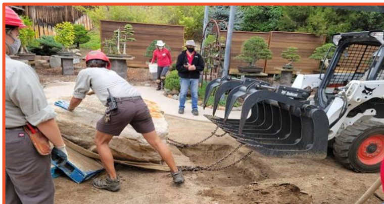
Installing the Rock

Several SDBC members have volunteered to join the Pavilion volunteers and are going through the Zoo-Safari Park orientation. . . we look forward to their participation soon. It would be ideal to have volunteers at the Pavilion every day, but we remind the visitors and Safari management regularly that we are SDBC volunteer bonsaists and put in the volunteer hours beyond our regular jobs, responsibilities, and time. They understand and do appreciate all the hundreds of extra hours when we are on site. Of course, we find this experience educational and enjoyable too!