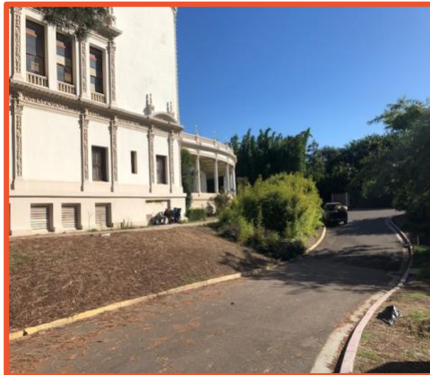
Rear of organ pavilion

We have a unique program planned with Jonas. He is asking that members bring pine and other conifer trees for a review and assessment. He is looking for trees in all stages of development - from seedlings to refined. We need a total of 15 pines and 15 conifers. If you have an interest in bringing in a tree, please contact me at the email address found at the end of this message. We ask that members in good standing bring no more than one tree to allow as many members as possible to participate. Please note that the review will be brief and will not include a comprehensive assessment of the tree. If you prefer a more comprehensive analysis of your trees along with a detailed discussion, please consider participating in the semi-private workshops offered by Jonas. They are limited to five students per workshop. We have a couple of morning and afternoon spaces available. The morning session runs from 9:00 am to 10:15 am; the afternoon session will run from approximately 12:30 pm to 1:45 pm. The cost to participate is $45.00. The workshop sessions with Jonas will take place at the JFG. Please contact me by email if you want to participate. lgdltx5@gmail.com .