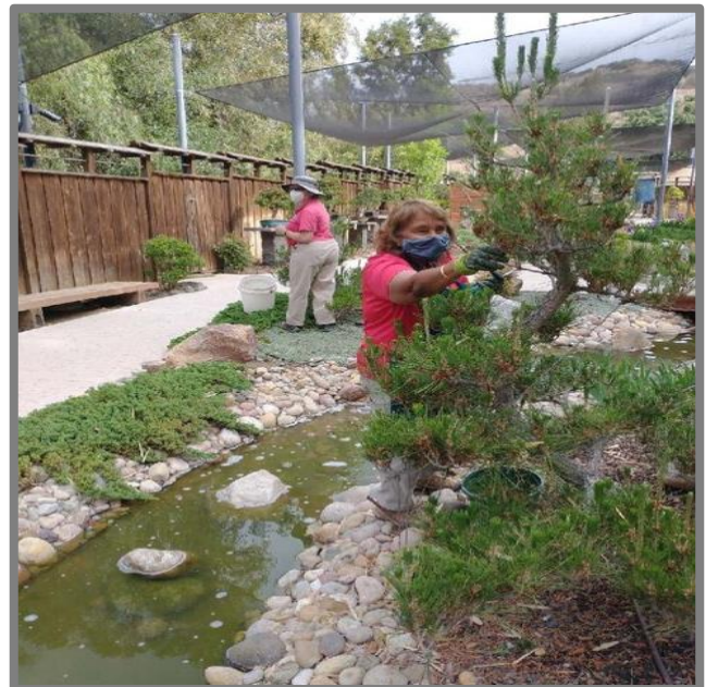
Trimming the Pines

The Pavilion trees are aging beautifully! Come and see and photograph your favorites!