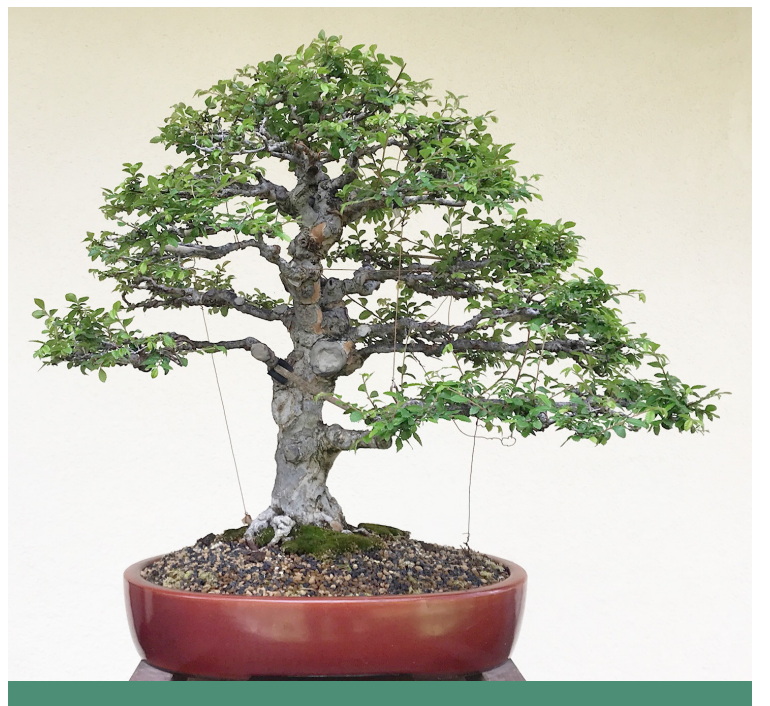
Jim Barrett Chinese Elm, donated September 2019

Managing Deciduous Growth - Continued from Page 1