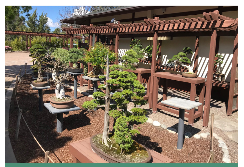
JFG bonsai collection, with one of three new display pedestals visible, lower right

Please keep yourself and others safe, enjoy springtime in your garden, and look forward to seeing each other when this has passed!