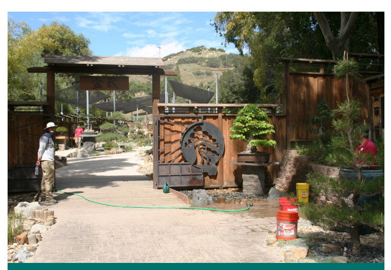
Wider view showing the new pedestal and impressive bonsai and how it has the visual impact of the entrance. Adding to the view is the double trunked Hisaysu Olive on a large pedestal in the background. There are plans for more improvements to other spots in the entry area to make the whole entry very memorable.