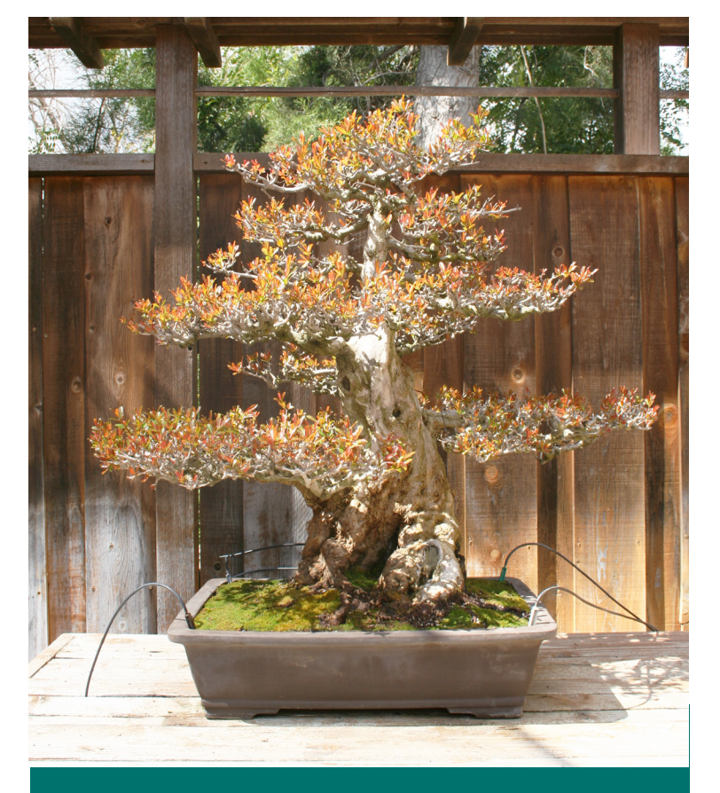
The Pomegranate is back on the display table. Planted a bit lower in the pot and moss re-applied to the soil.

Since the Zoo and Park are closing on March 16th, we will not have the work day on March 21st as previously announced. As soon as we receive an re-open date