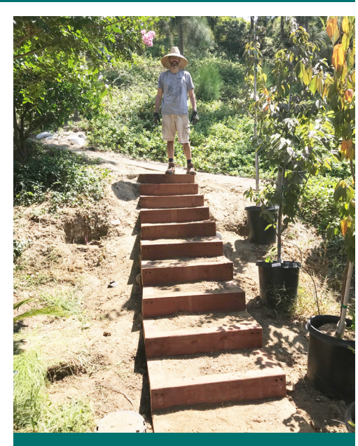
But seriously, these are the real steps to the the JFG lower garden.