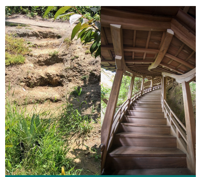
LEFT: Steps to JFG lower garden "before" RIGHT: Steps to JFG lower garden "after," modeled after steps at Eikan-do Zenrinji temple in Kyoto.

on pines. Persistent infestations may require treatment with a miticide. Juniper scale, on the other hand, is pretty impervious to water, but is well controlled by insecticides or by dabbing with alcohol for small infestations.