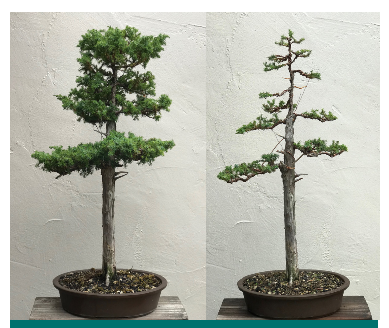
Foemina juniper from Charlie Mosse, before & after pruning