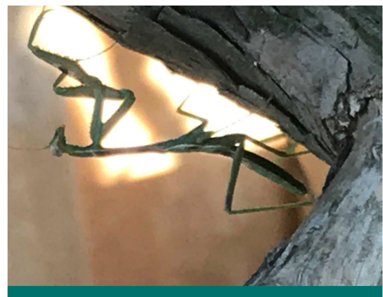
Juvenile praying mantis rests in a crook of a juniper bonsai.