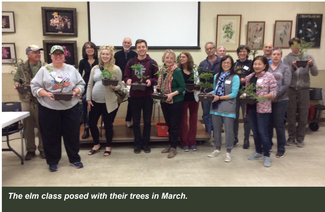
The elm class posed with their trees in March.