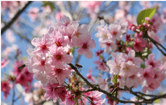
Bees on cherry blossoms at the JFG

Thousands of guests poured through the JFG March 22-24 for the annual Cherry Blossom Festival. Visitors were rewarded by a timely