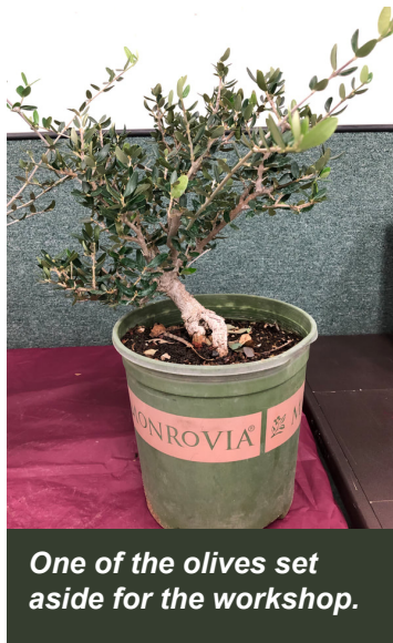
One of the olives set aside for the workshop.