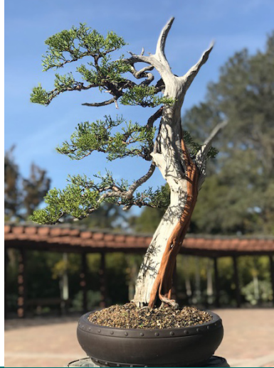
Before and after photos of year-long work on California Juniper. Last year the tree got a nicer, round, drum pot and was allowed to grow and put on foliage on lower branches. And this month the live vein was cleaned and the pads thinned and wired."

wiggle room to have fun and shape their own experience.