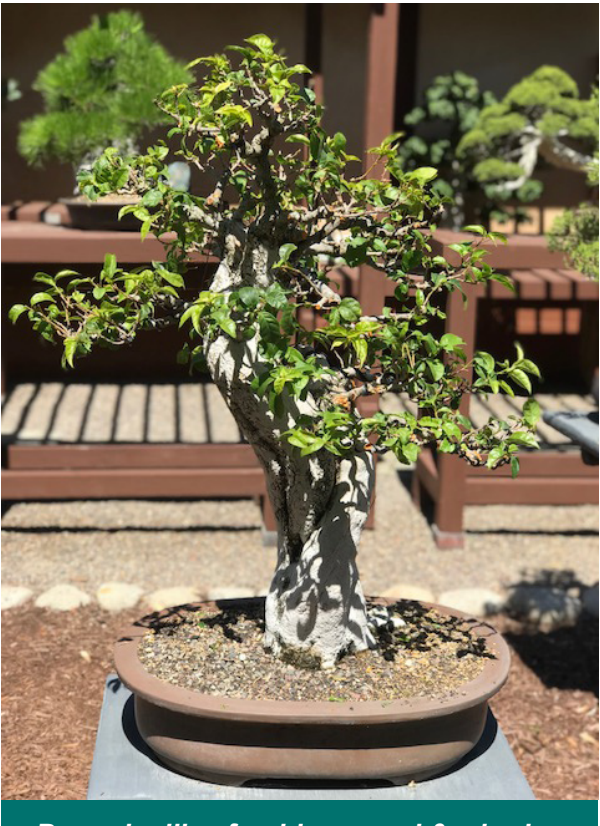
Bougainvillea freshly pruned & wired

thrilled to accept a donation of that diamond-in-the-rough just taking up space in your garden. Of course, finished masterpiece donations are also welcome! A donation is a great way to secure a place in the pantheon of bonsai history... and much cheaper than erecting a statue of yourself along the freeway. Plus, we'll be really, really grateful. Just contact curator Neil Auwarter (neilauwarter@hotmail.com).