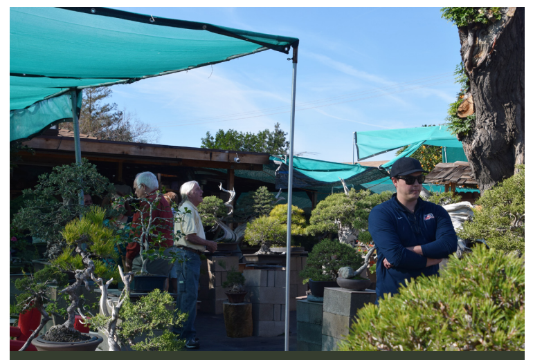
Club members at the nursery stop during the Winter Silhouette trip.