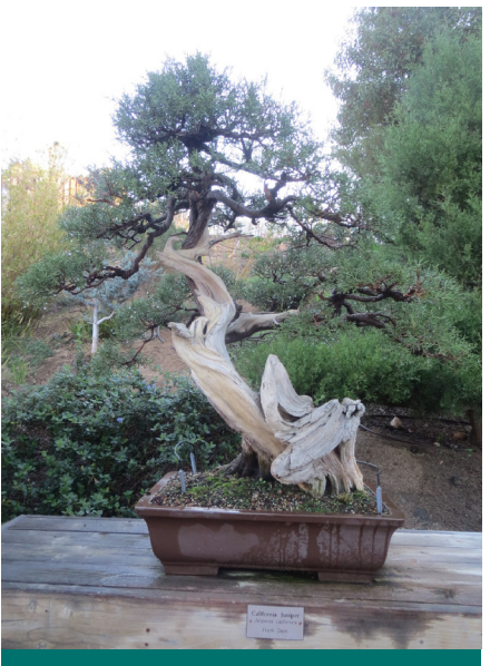
Dr. Dixon's California Juniper in the early morning glow.

We continue to try a couple of new techniques with bonsai that do not always respond well in the Pavilion and we always try to search for the ideal "right" pots for some needed transplants. Donations are gratefully accepted! It has been most helpful for the volunteers to be able to refer to our detailed inventory books and to update them each time specific work is done on one of the bonsai... Each tree in the collection has a number and a photo in the books and past history is valuable as we continue to maintain the collection. During this