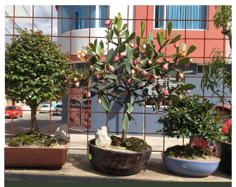
Nyon Nursery bonsai trees for sale, Ecuador

Until 10 years ago, most of the bonsai were brought into the country from Colombia, but that is now banned, so all recent stock have been developed in Ecuador. I met a brother and sister duo who own two nurseries.