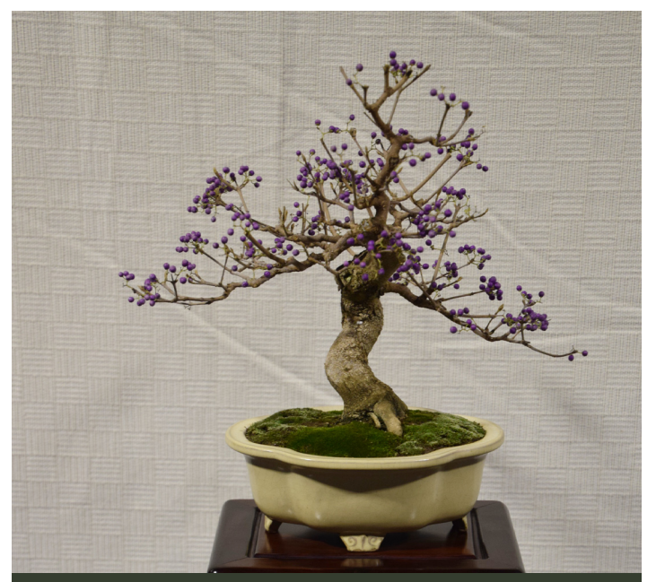
This Callicarpa is one of many great trees on display this year at the Winter Sillouette show.

We are very fortunate to have these two experienced members as part of our club and appreciate their willingness to share their knowledge with us.