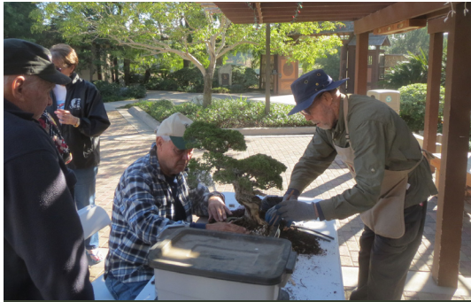
On December 27, volunteers did a re-pot and re-positioning of a Shimpaku. This image shows them firming the soil around the root ball.

There are more trees waiting in the wings to be donated.