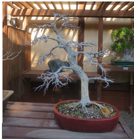
A Texas Cedar Elm at The Garden in December.