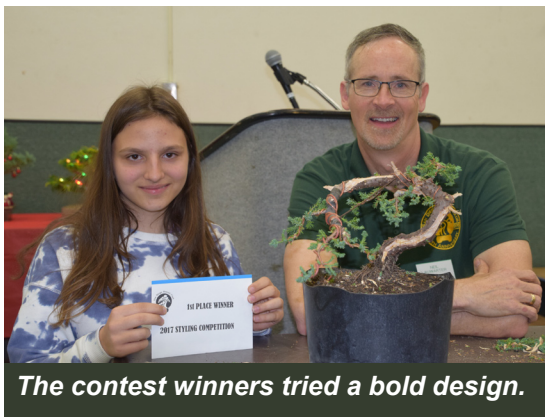
The contest winners tried a bold design.