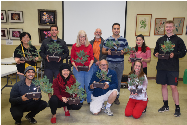
The beginner juniper class wrapped up in December with re-potting.

New members are always excited about taking the Beginners Classes, and several have asked to be put on a waiting list for the next class. If you are a new member please note that sign-up sheets for all classes and workshops are first available at the Bonsai Club meeting TWO months before the classes/workshops are held. We do not start a waiting list until after the sign-up sheet has been put out at the meeting and filled.