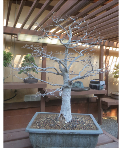
A Hackberry at The Garden in December.

I want to wish all of you a happy, prosperous and peaceful New Year.