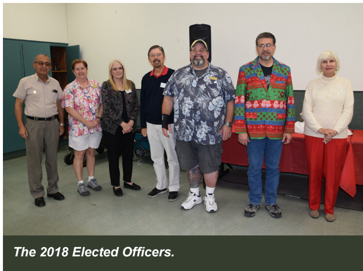
The 2018 Elected Officers.