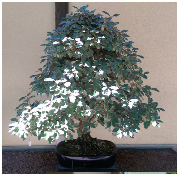
A silverberry tree with the leaves catching the light and a trident maple botanical garden in Montreal.

I've been on a great vacation with my grandchildren to Quebec and Montreal. Montreal reportedly has the third largest botanical garden in the world, including a Japanese and Chinese Garden, so of course I wanted to check out the bonsai. I've enclosed a few pictures. I continue to appreciate the trees in the club's collections.