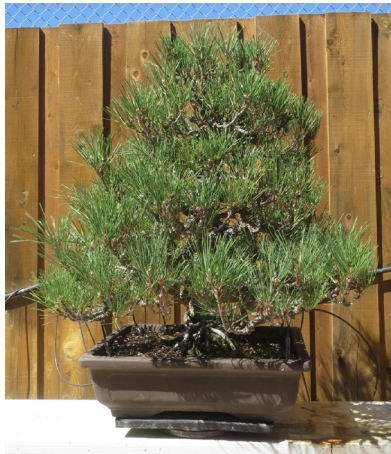
Charlie Tamm's donation of a very beautiful Japanese black pine to the Pavilion.

We have been using that "closed to the public time" to continue updating and "remodeling" garden areas of the Pavilion. Volunteers, Cathy and Barbara , dug out our bearded irises along the streambeds for replanting later in the fall.