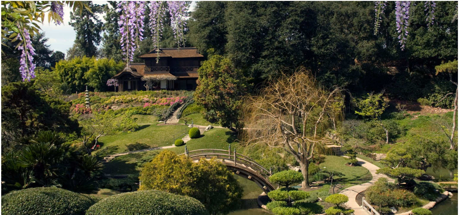
The Huntington Library's Japanese Garden is a destination in and of itself.

Cost for the trip is $40 for the bus. We will depart from the Balboa Park bus staging area at 7:00am and the Carlsbad staging area at 7:30am. With cooperation of Saturday afternoon traffic, we will return to Carlsbad by 6:30pm and Balboa Park by 7:00pm. A sign-up sheet will be available at the next Club meeting, or you can sign up via our website, www.sandiegobonsaiclub.com .