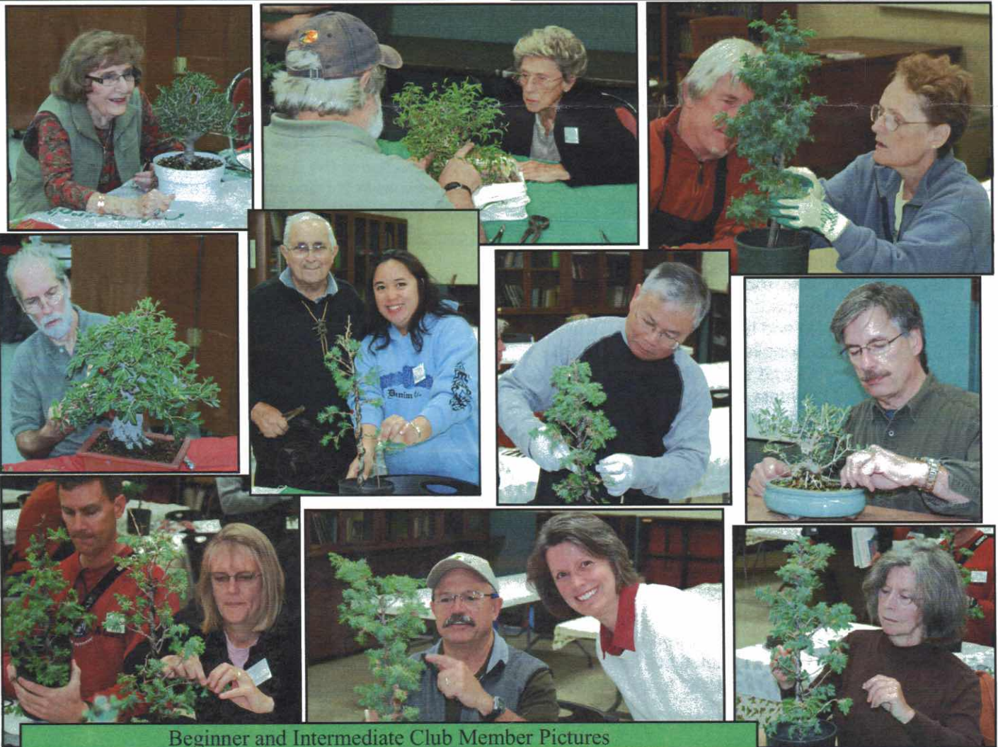
Beginner and Intermediate Club Member Pictures