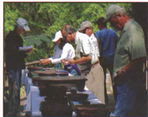
A picture from last the 2009 meeting, the table is full of pots! You can see all sizes, shapes, and colors!

Passes for the May meeting at the WAP (admission and parking) will be available at our Spring Show for those who signed up at the April SDBC meeting.