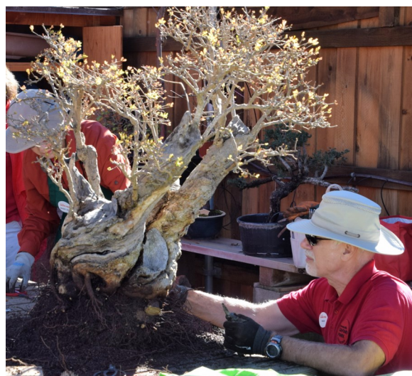
2015 Re-potting at the Safari Park

Thanks to all Volunteers—you know who you are!