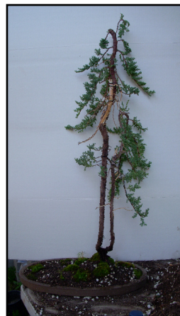
After cleaning, wiring, and jin