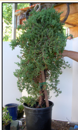
Garden Juniper Nana from the Auction Table

Three days later, we decided to work on this tree and discovered to our surprise a beautiful specimen. At first sight, I thought that some branches were very nice and appropriate for a Literati Style Tree. With careful inspection, we were surprised to find a double trunk (Sokan) Tree. After cleaning and cutting some branches, we wired the tree, decided to leave some jins and peeled the bark from the anterior part of both trunks. We placed the juniper in a round shallow Japanese pot. At the end, we feel we found a gem hidden in the auction table. This is the first step of a yearlong work as part of the Mas Takanashi Educational Grant, a great opportunity to learn and another gem at SDBC.