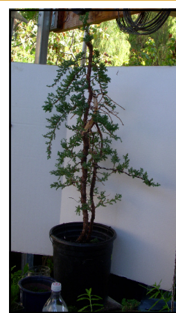
After cleaning, wiring, and jin