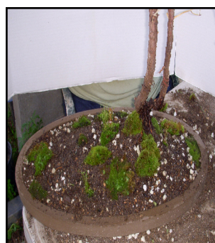
We added moss to the planted tree