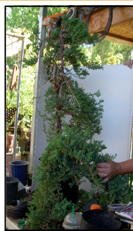
We removed the top of one trunk