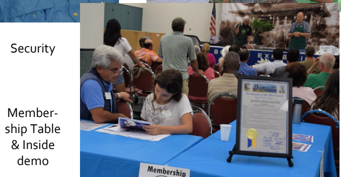
Membership Table & Inside demo