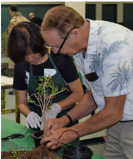
A photo from Sept's repotting workshop