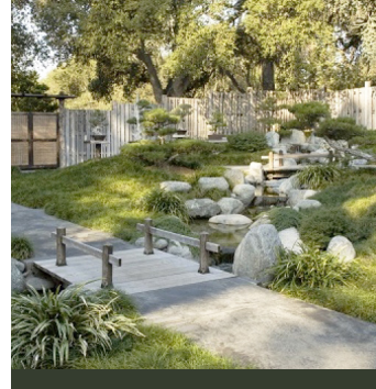
The Japanese garden at The Huntington

For our February bus trip, we will visit the Huntington Library, Art Museum, and Botanical Gardens, which houses the Golden State Bonsai Federation Bonsai Collection in Southern California. The Bonsai-A-Thon is scheduled for Saturday and Sunday February 22-23. In addition to the wonderful bonsai exhibits, there will be demonstrations, workshops, and a large