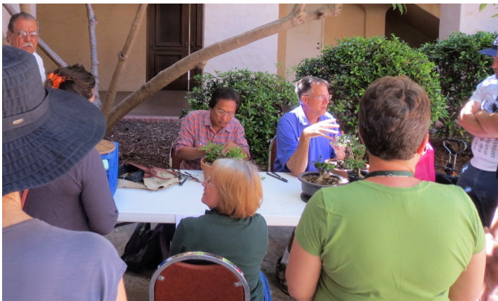
Tear down and out of here