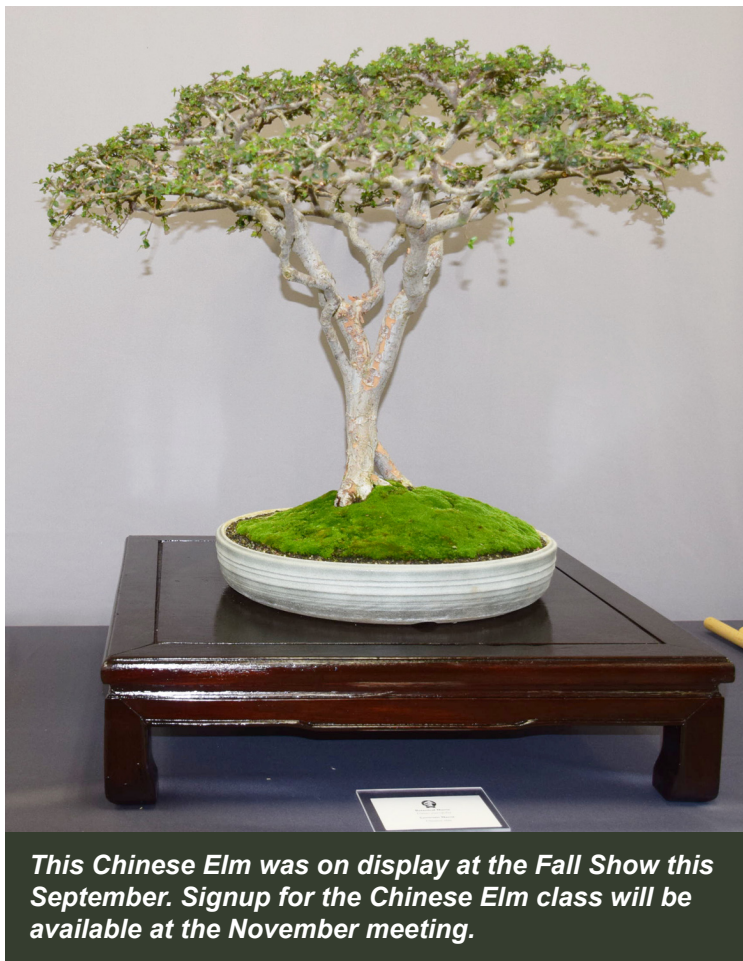
This Chinese Elm was on display at the Fall Show this September. Signup for the Chinese Elm class will be available at the November meeting.

The class starts at 8:30 am in Room 104 Please be on time or a few minutes early. Observers are always welcome. Even if you did not get in to the class, you can still observe and learn.