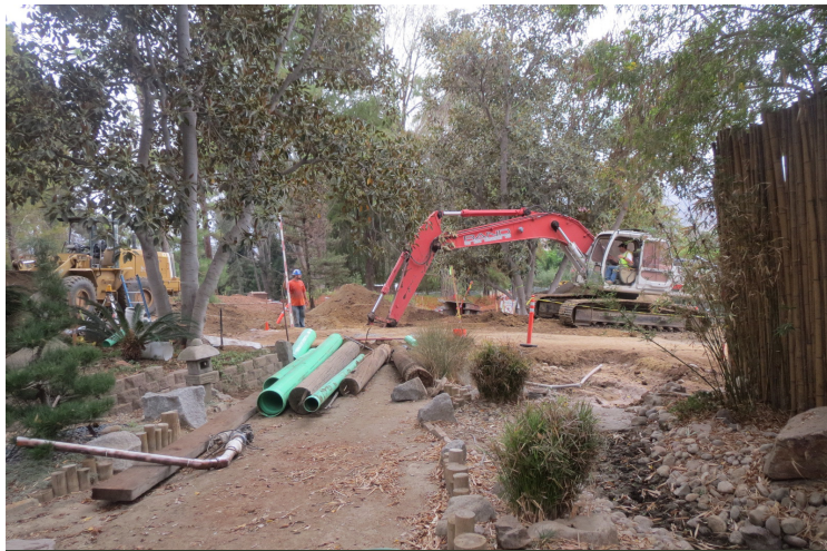
The area out front of the Pavilion gate that will be a new road. The lower pond will be demolished and rebuilt by the Safari Park closer to the gate.