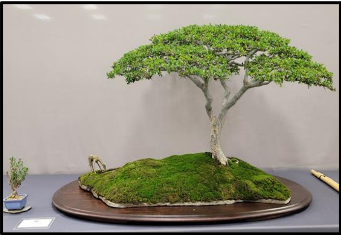
Nazim Colak’s Chinese elm