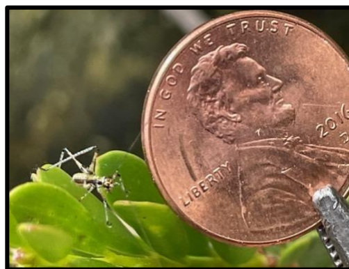
Who chewed up the new growth on this melaleuca bonsai? This tiny katydid did.