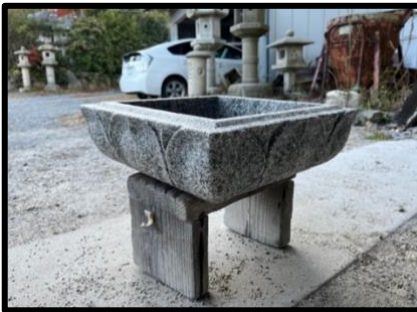
Carved granite bonsai pot by master stone smith Taka Saida. Interior dimensions 11"x11"x3" deep. Price $4,000

As part of the JFG's Master Series program, the garden will host a stone lantern tour on Saturday, January 27, 10:30-noon, led by Taka Saida.