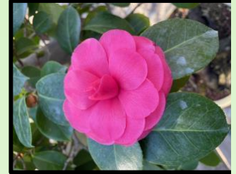
First bloom of the season on the Camellia in the JFG collection.