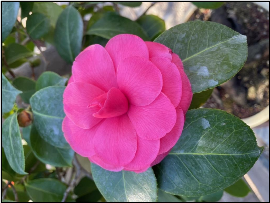
January 2024 The Bonsai Wire

San Diego Bonsai Club P.O. Box 86037 San Diego 92138