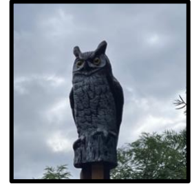
New owl decoy will (hopefully) scare moss-molesting birds from the collection.

This fall some uninvited birds began visiting the collection to tear up moss, particularly on the Larry Ragle foemina forest. Two owl decoys and streamers of bird-scare tape were deployed, with moderate success. If only birds could be trained to limit their efforts to Scotch moss!