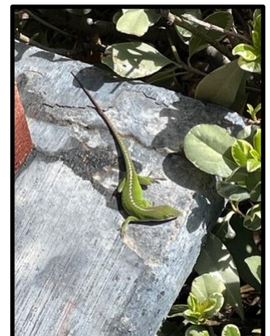
Went to sweep this leaf off a bonsai pedestal, and it wasn't a leaf at all.