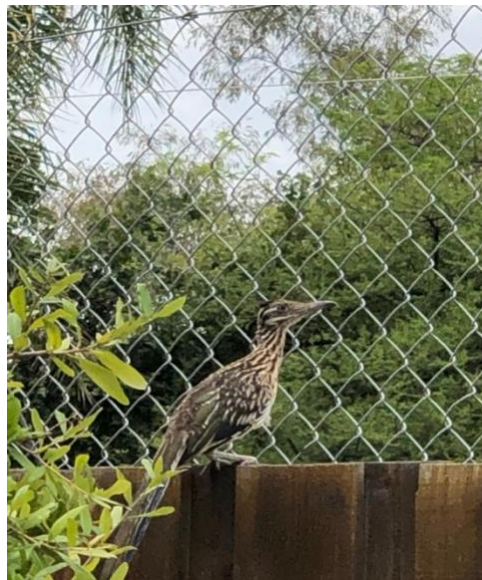
Wildlife at the Safari Park Bonsai Pavilion