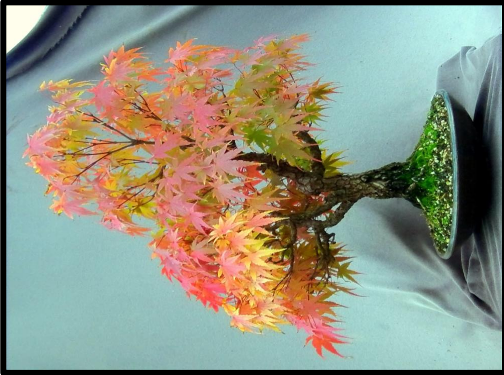
October 2023 The Bonsai Wire