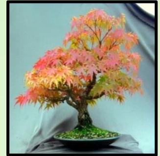
Fall foliage from internet gallery.

Finally, the October meeting will again be held at Lake Poway. Our annual Family Picnic and Auction is a fun event for everyone. During the meeting, we will introduce the candidates for next year's Board of Directors. Details on the event can be found in the newsletter.