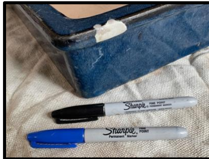
Chip filled with Oatey “Fix it Stick” two-part epoxy