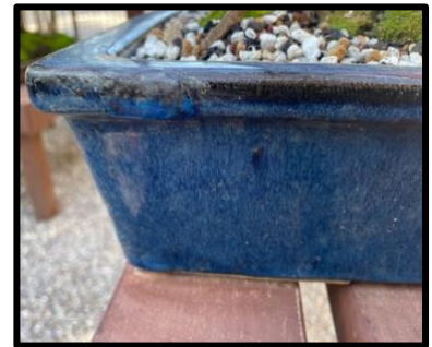
Finished repair, with chip filled, then colored with Sharpies, and coated with polyurethane.