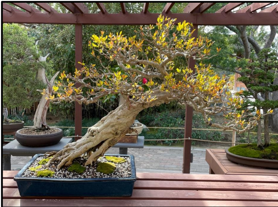
Repaired pot with its new occupant, the Hisayasu pomegranate