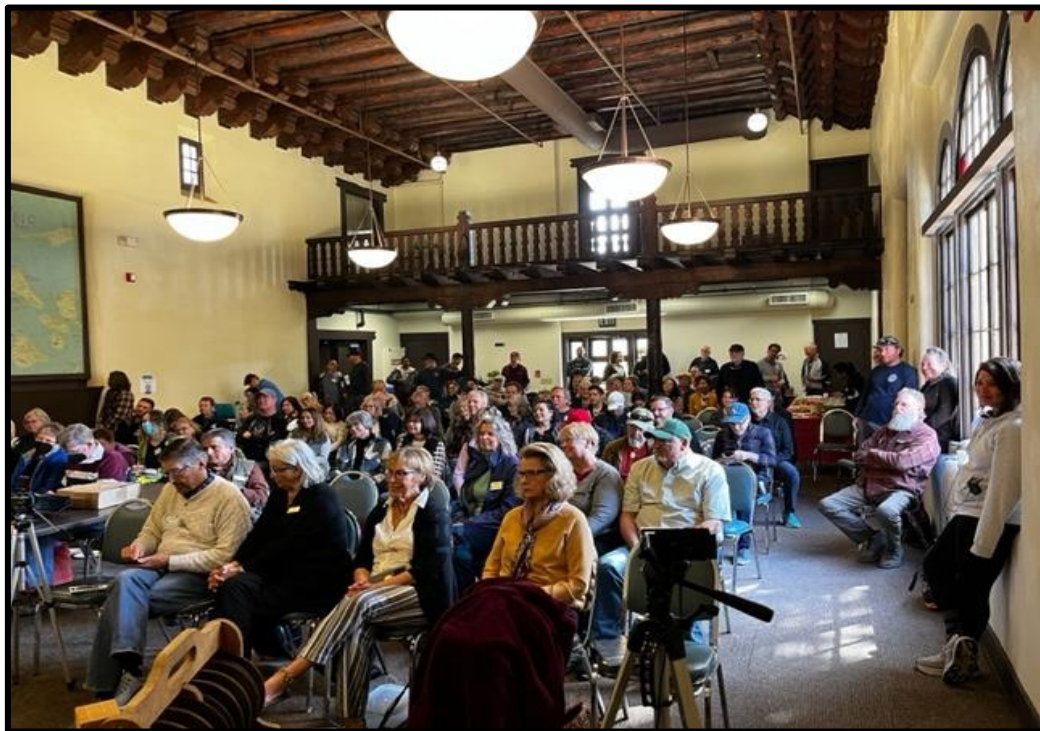
February meeting at Balboa Park Club building