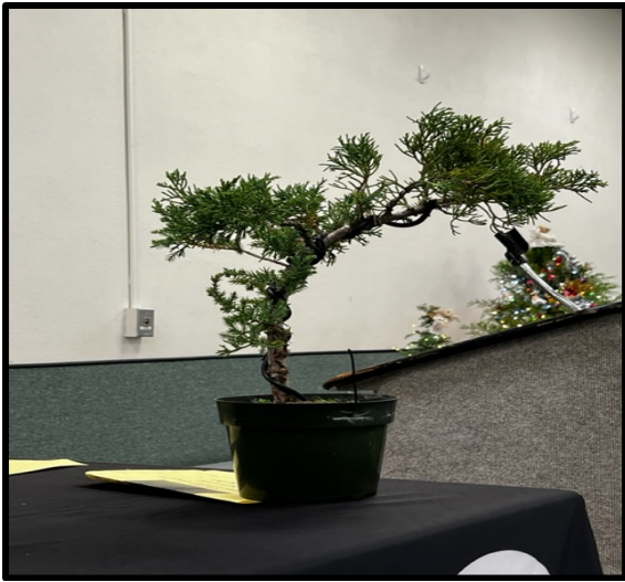
The first-place tree styled by Lien Liu