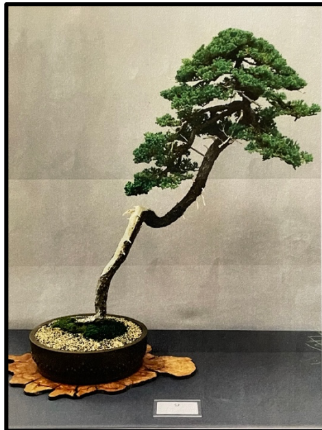
Transformed tree at 2017 Fall Show