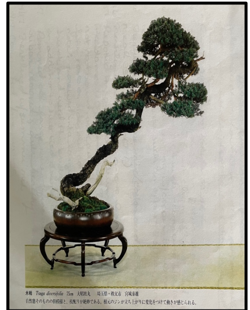
Inspiration Kokufu tree: tsuga diversifolia