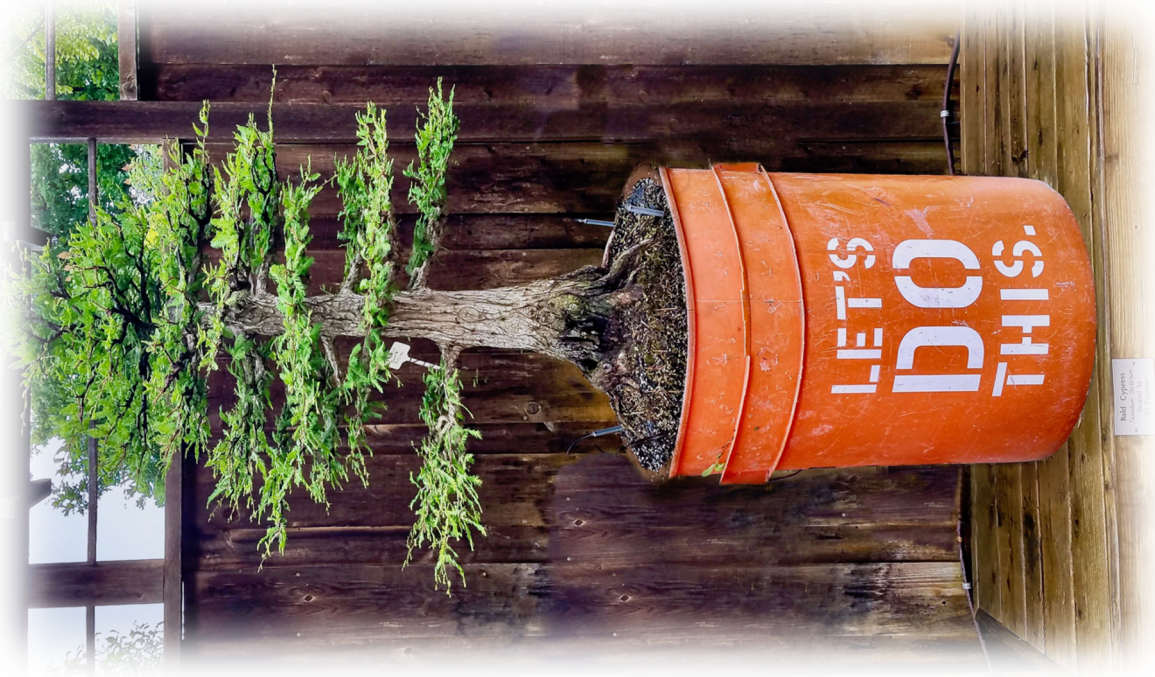
July 2020 The Bonsai Wire in the Time of Covid-19

San Diego Bonsai Club P.O. Box 86037 San Diego 92138