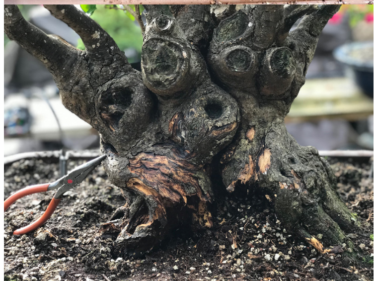
Privet front & back, close-up with plyers for scale

disappeared? Well, last month we found rain was coming down our chimney, which has no rain cap. So while we’re waiting for a cap to be installed, I just popped a 16” round bonsai pot over the stack. (See photos.) Looks nice with the clay tile roof, no?