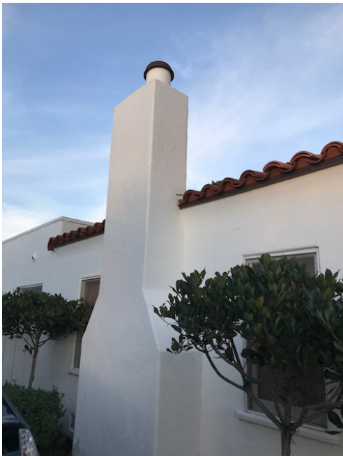
Bonsai pot as chimney rain cap