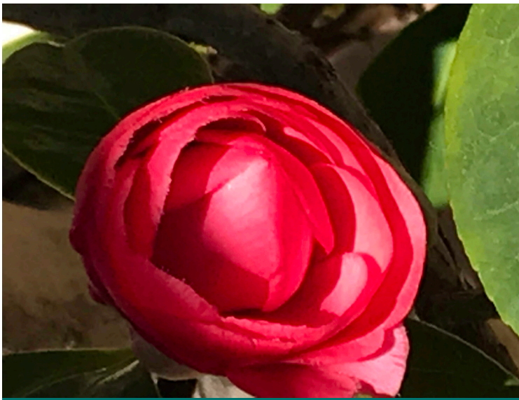
First camellia flower to break this season