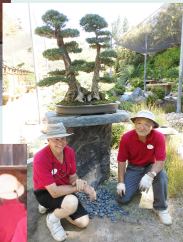
Massive olive repotting project completed.