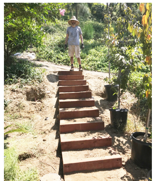
But seriously, these are the real steps to the the JFG lower garden.