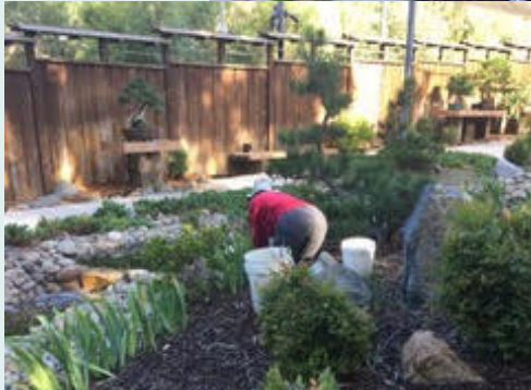
Weeding the center garden