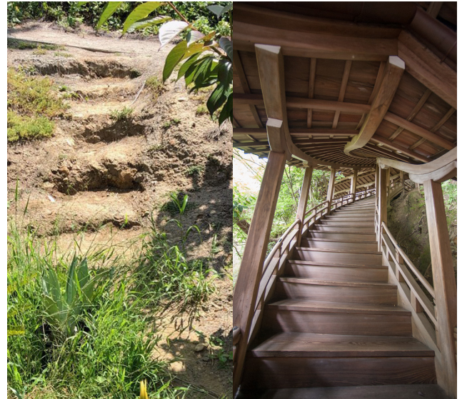
LEFT: Steps to JFG lower garden “before”

on pines. Persistent infestations may require treatment with a miticide. Juniper scale, on the other hand, is pretty impervious to water, but is well controlled by insecticides or by dabbing with alcohol for small infestations.