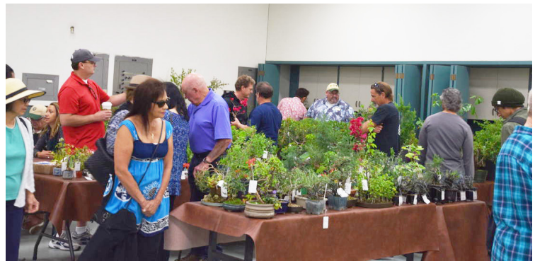
Guests browsing the sales tables at an SDBC Spring Show

Our club Spring Show and Sale is on Saturday, April 25th and Sunday, April 26th. We are open to the public on Saturday and Sunday from 10:00 am to 5:00 pm. Show setup starts about 3:00 pm on Thursday afternoon April 23. Starting at about 3:00 pm Friday, April 24th, trees for the show (and sale) can be brought to Prado room 101. We need volunteers for security, cashiers for the plant sale, and greeters at the door and the membership table. We will have volunteer signup sheets at the February, March and April club meetings. Please do not hesitate. Believe me, it doesn't require any expertise.